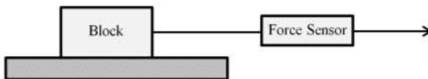
Figure 1. Schematic setup for measuring the limit of the static friction.